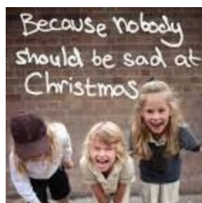
College St Vincent de Paul Society Christmas Appeal 2016

Many thanks to all students, especially our members, and to staff, who helped in organising the various activities of our Christmas Appeal on St Francis Xavier's Day late last term and also to those who supported it. The total amount raised was $780.65 and several cartons of presents were also donated. A generous result!