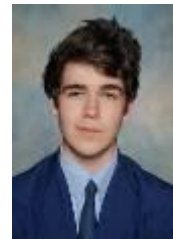
Conagh Punch Tantrum Theatre